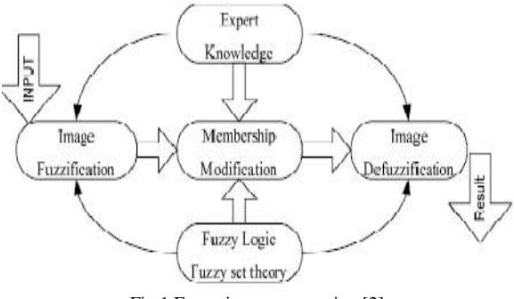
Fig 1.Fuzzy image processing [2]

1. HOUGH TRANSFORM METHOD: The process includes image fuzzification, membership modification, and image defuzzification. To adjust the brightness of image int operator is used. If the brightness value is greater than 0.5 then it will increase brightness of image if it is less than 0.5 then it decreases the brightness. For this fuzzy image enhancement procedure is followed. Fuzzy regions are divided in two parts: fuzzy edge and smooth region [8].